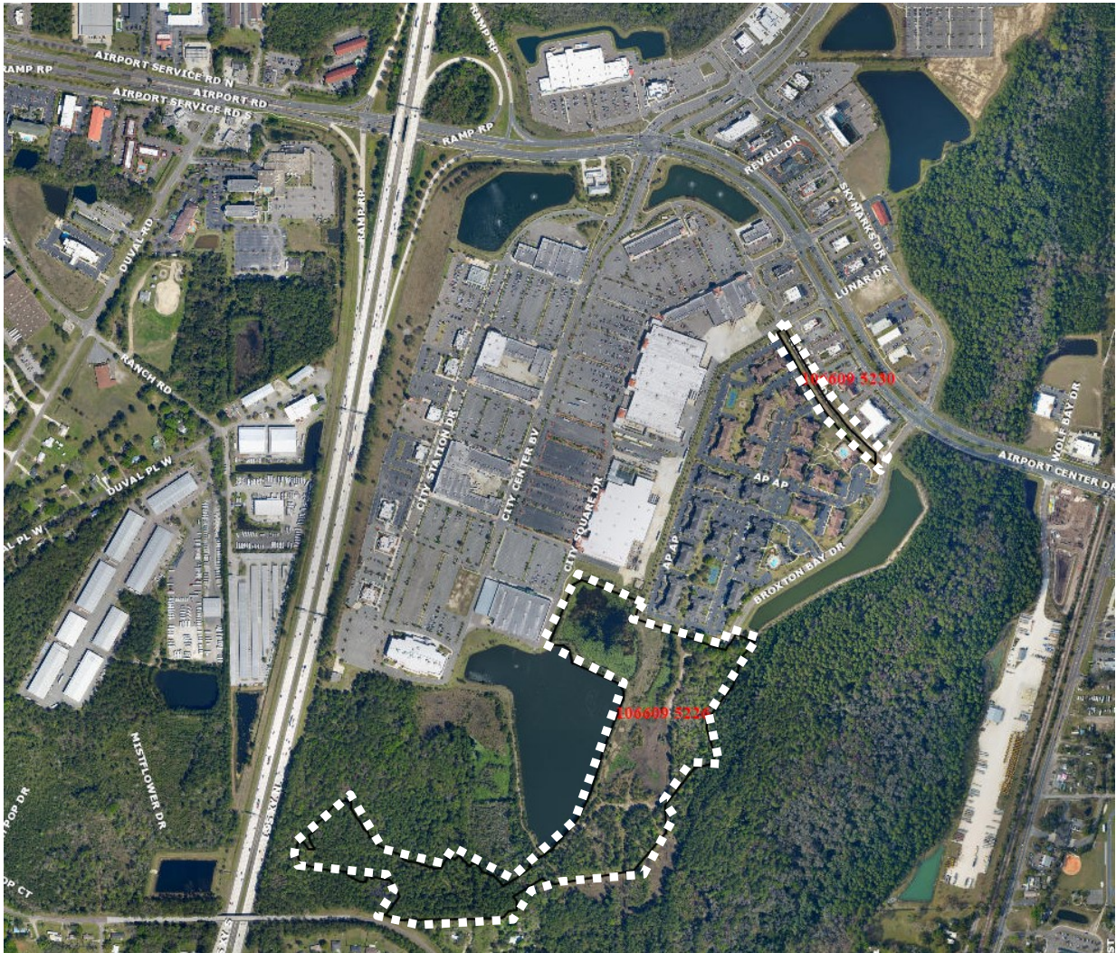
Aerial view of the subject site