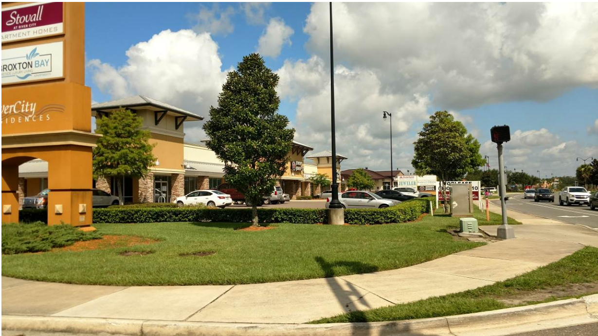
Commercial to the north of Nautica Drive right of way