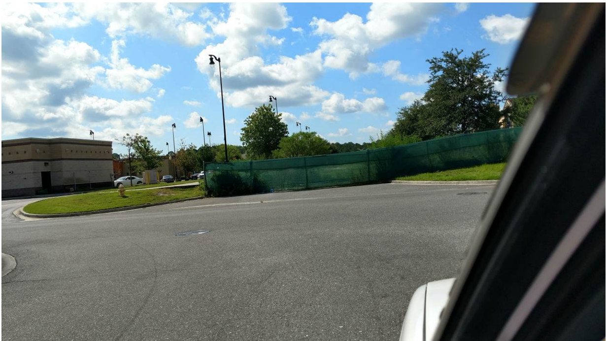
Unimproved Nautica Drive Right of Way