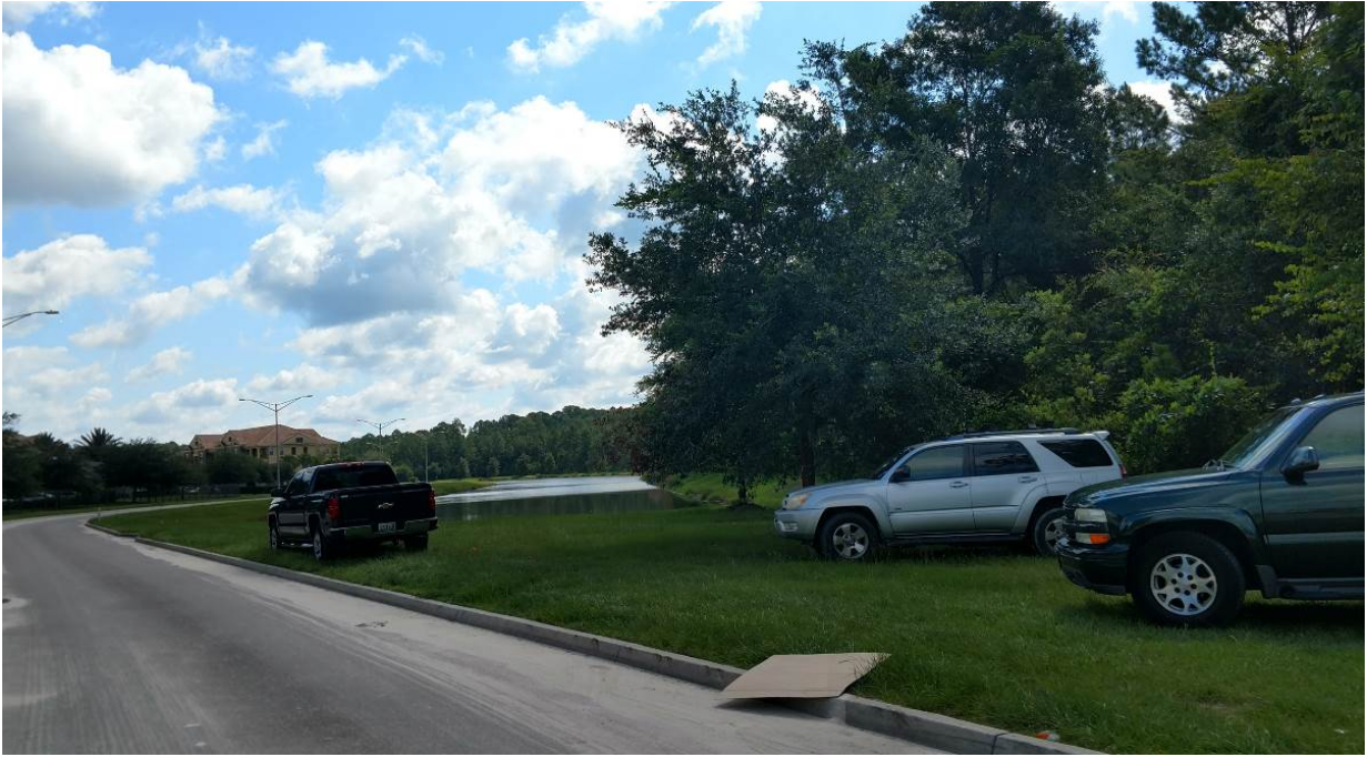
Retention to the north