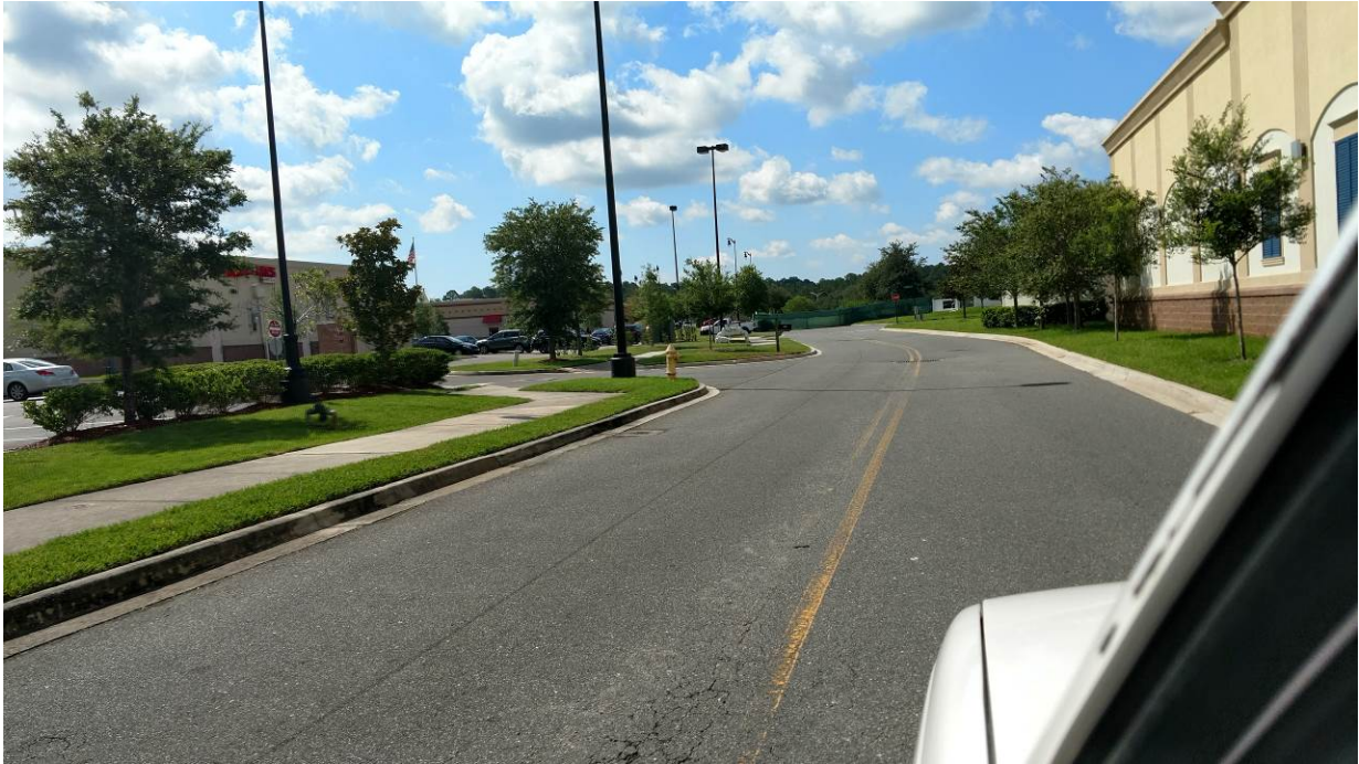
Improved Nautica Drive to the west of unimproved section