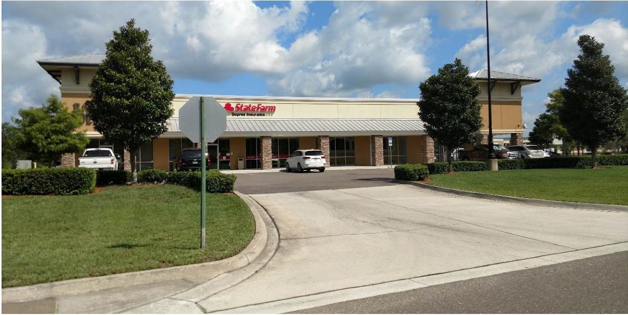
Commercial to the north of Nautica Drive right of way