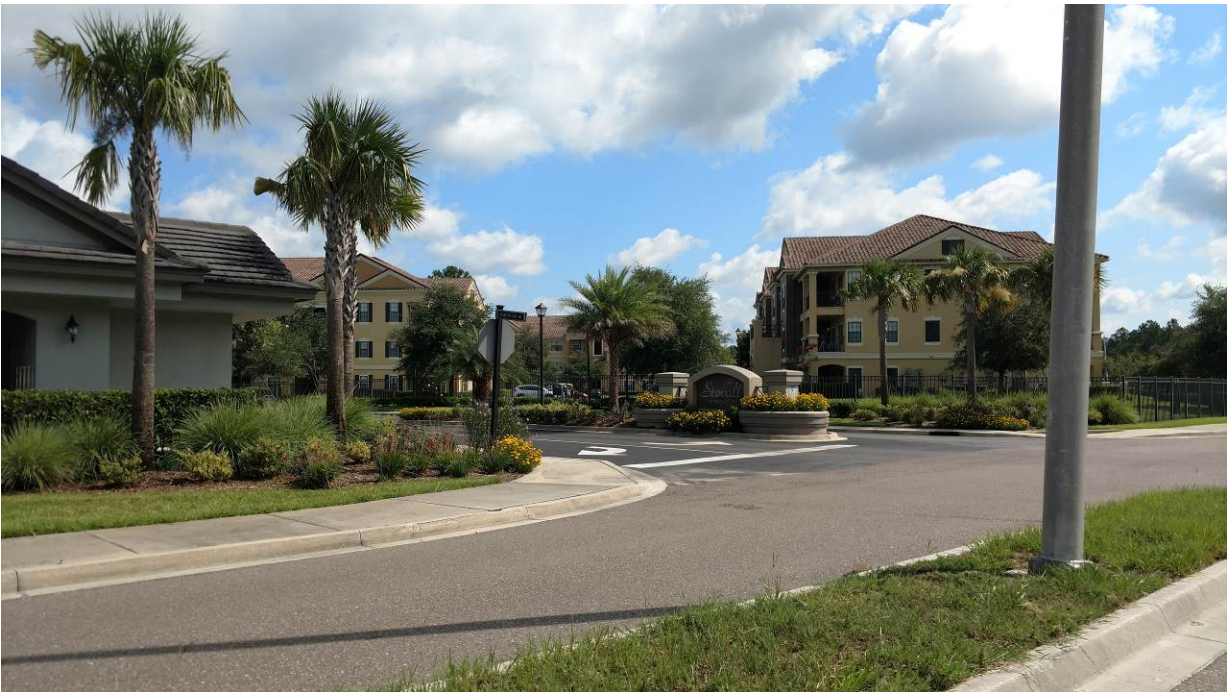
Multi-family to the north